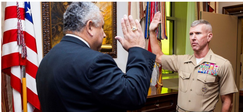
Secretary of the Navy Carlos Del Toro swears in Gen. Eric Smith as the 39th commandant of the Marine Corps, Sept. 22, in the Pentagon.