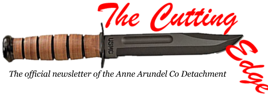
The official newsletter of the Anne Arundel Co Detachment