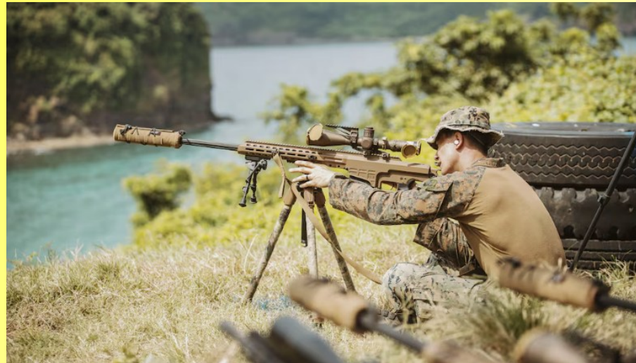
A Marine with the 15th Marine Expeditionary Unit fires a Mk22 Mod 0 in the Philippines, October 2024.

The Mk22’s effective firing range is 1,500 meters, while the effective firing ranges of the M40A6 and Mk13 Mod 7 are 800 meters and 1,300 meters, respectively.