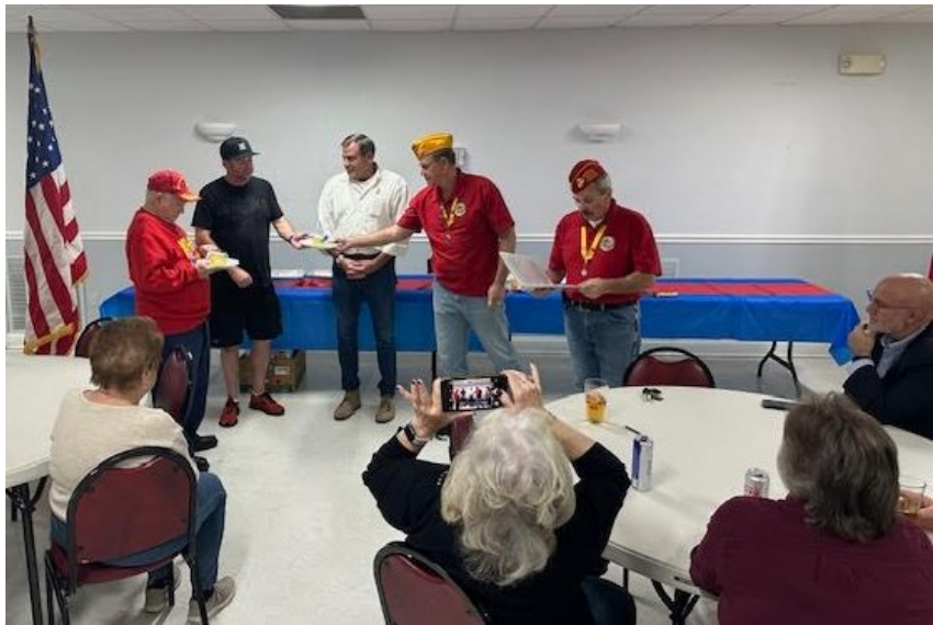
November 9, 2024: The detachment celebrated the 249th birthday of our beloved Marine Corps with the traditional cake cutting ceremony at American Legion Post 175.

The official newsletter of the Anne Arundel Co Detachment