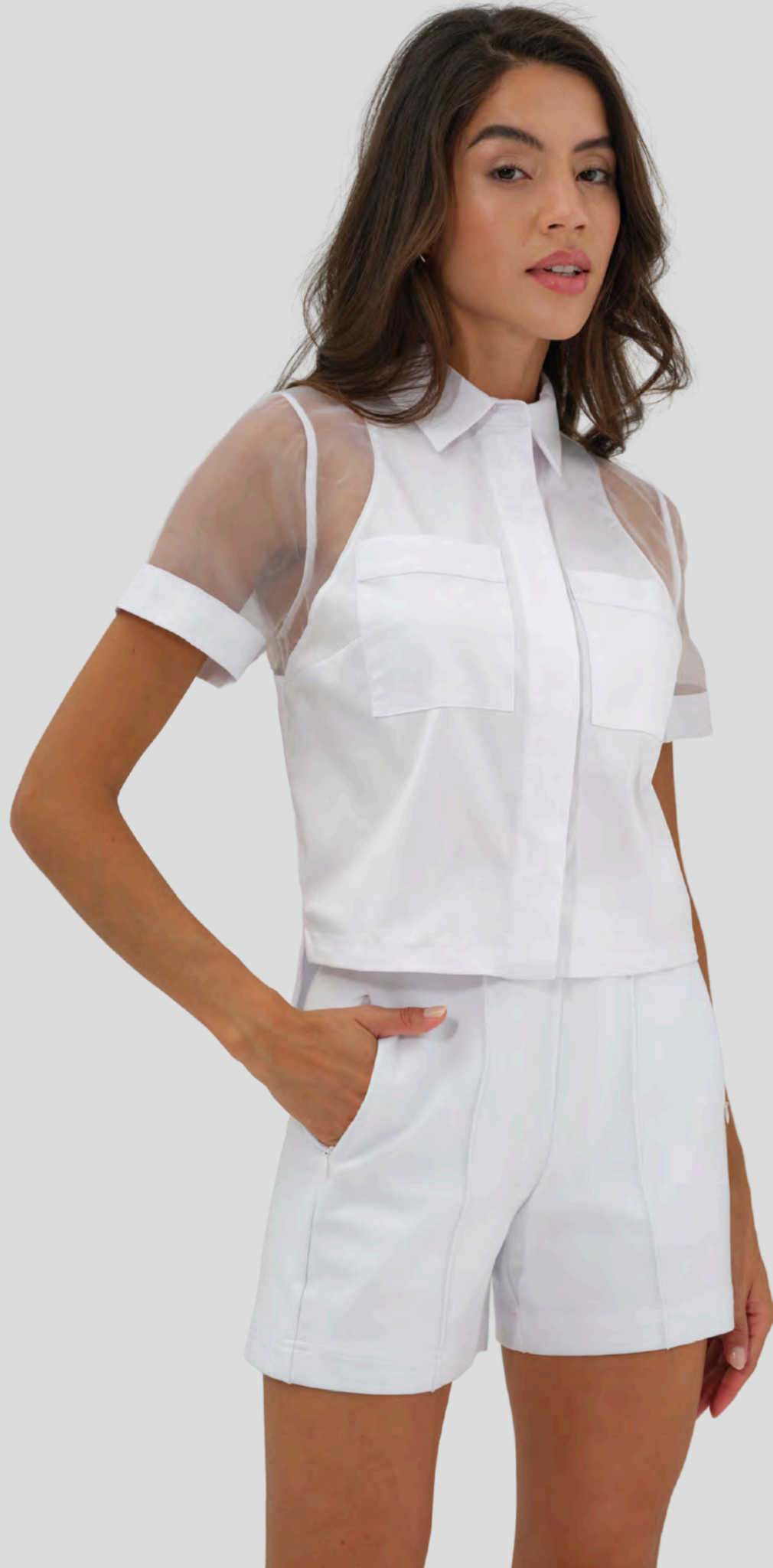
TOP JADE SHORT VIVIANNE