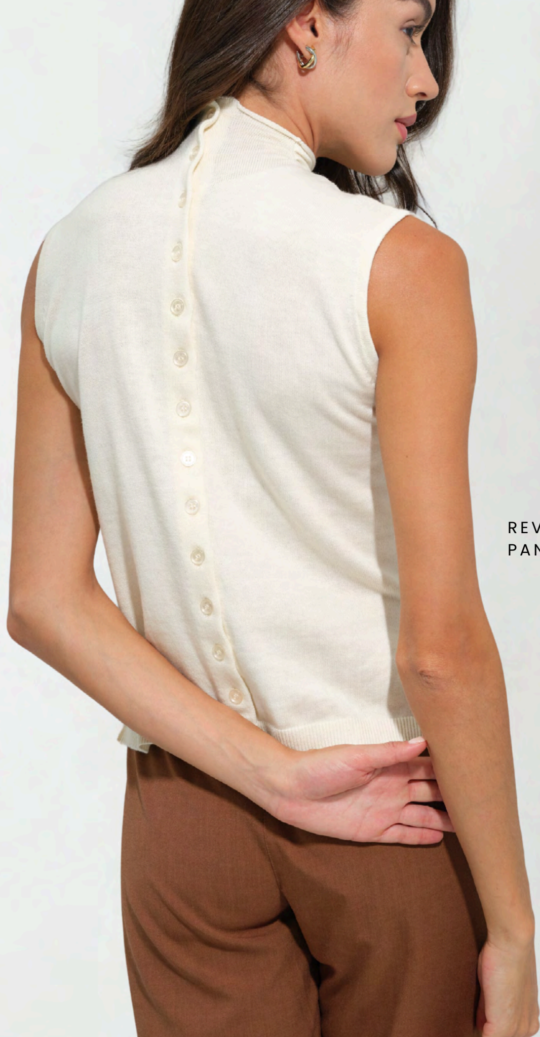
REVERSIBLE TOP VIOLA PANT NORIA