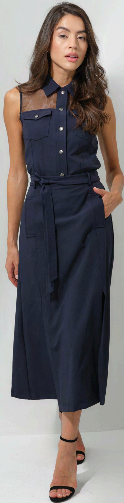
TOP LENOX SKIRT GALINA