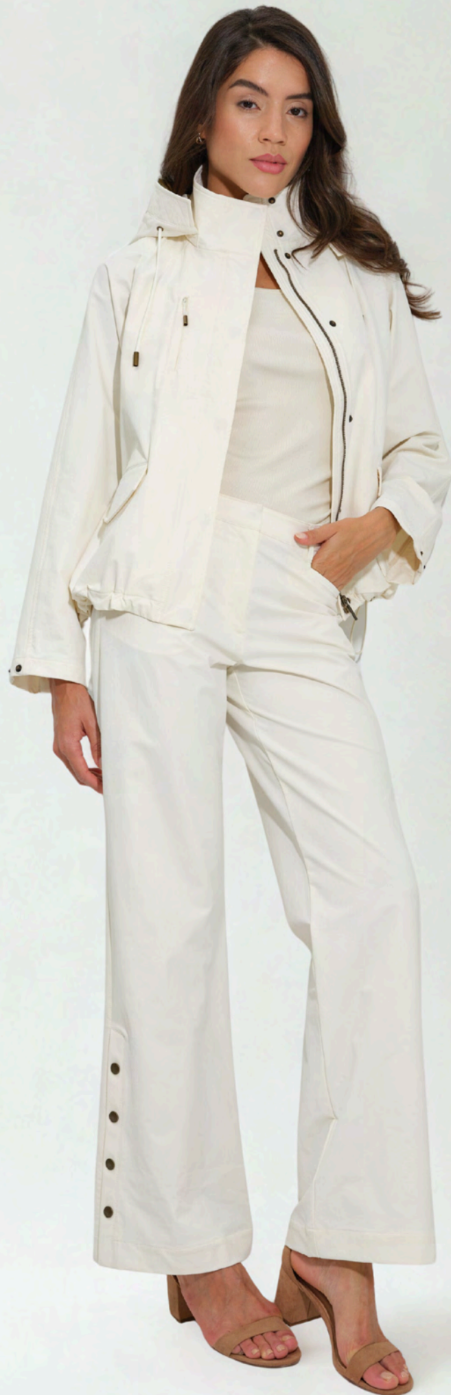
JACKET TIERRA TOP MIRANDA PANT ALEXANDRA