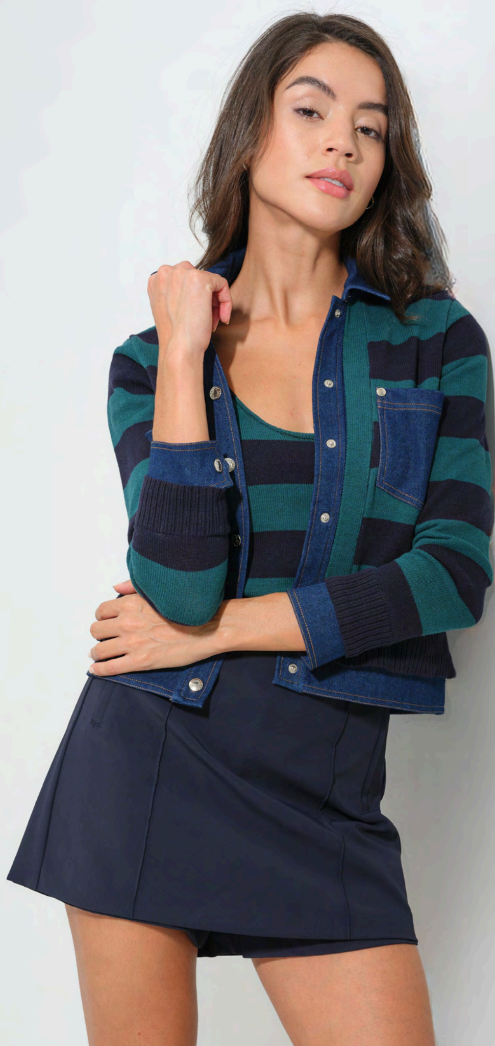
JACKET SIENNA TOP CAROLYN SKORT LAUREL