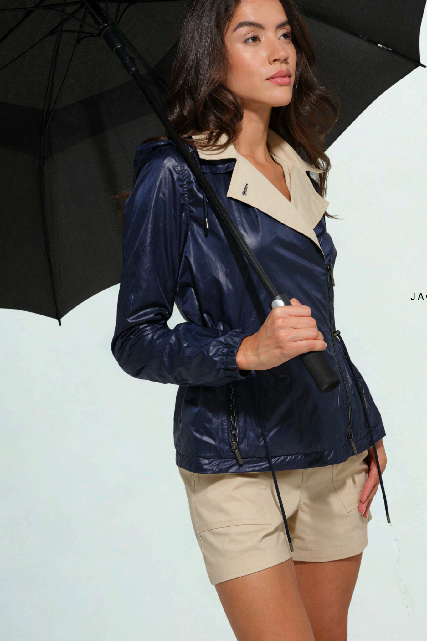
JACKET LEXIE (REVERSIBLE)