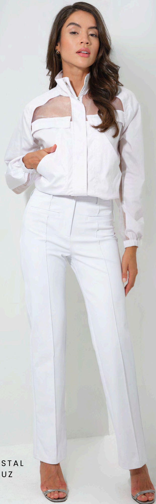
TOP CRYSTAL PANT CRUZ