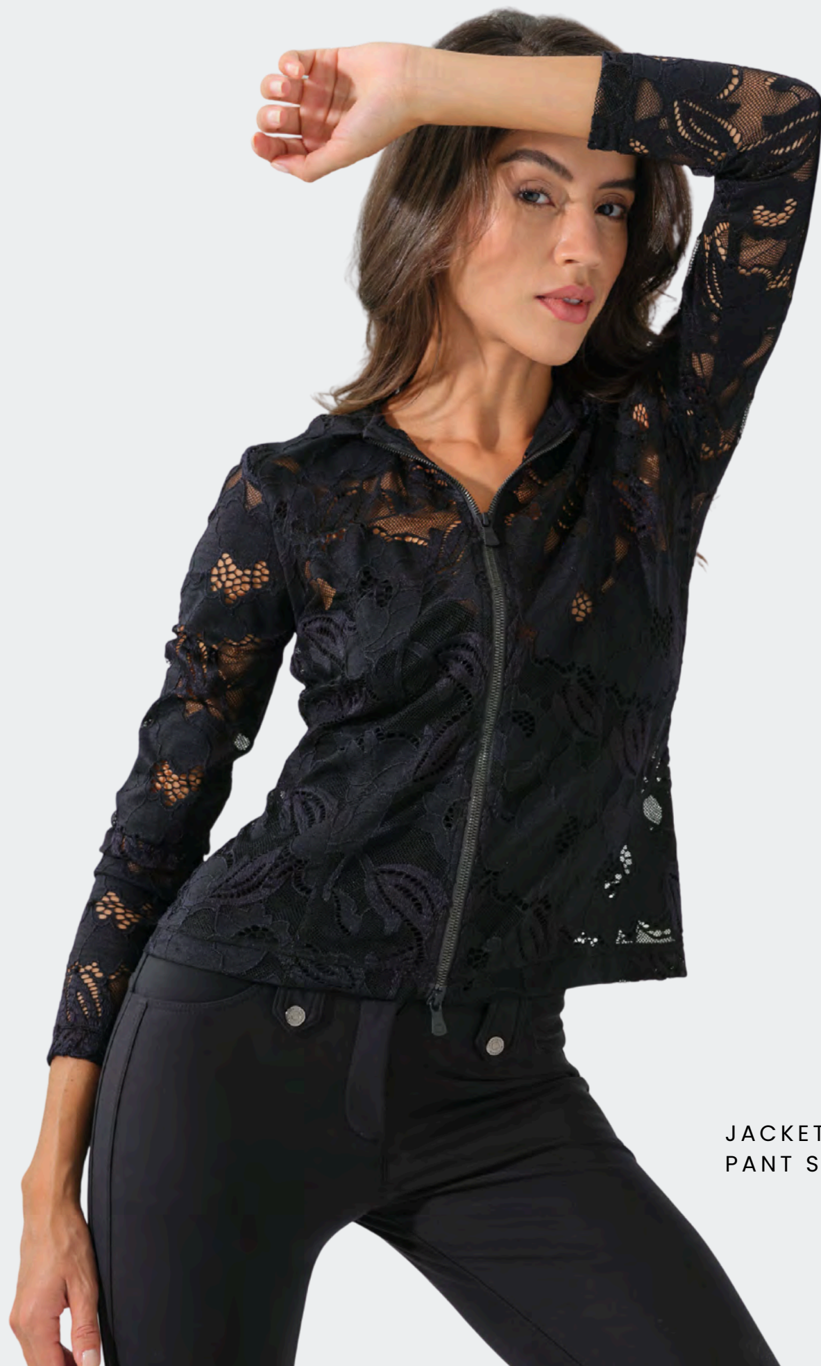
JACKET LACE BREE PANT SKYLER (ESSENTIAL)