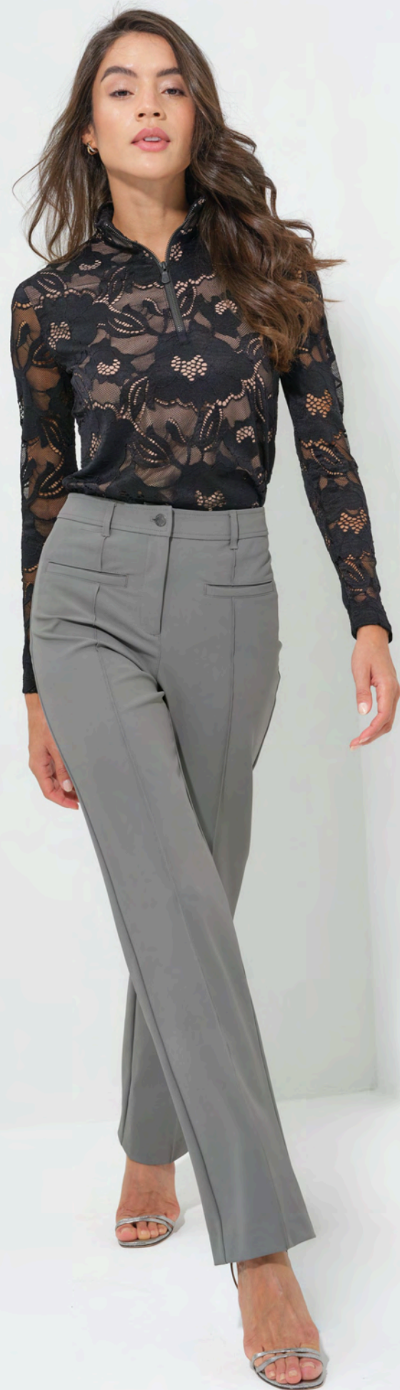
TOP LACE STACEY PANT CRUZ