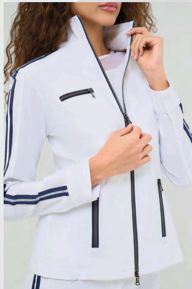
JACKET JUSTINE PANT LULI STRIPE