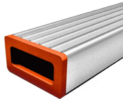
XL Series with Belt-Bumper™

The patented design of TUFF-STIK™ ensures that lumber is securely gripped from top to bottom, with ribs that significantly minimize bow or warp degrade during the drying process. This leads to higher-quality lumber that commands top dollar in the market, thereby increasing profitability for mills.