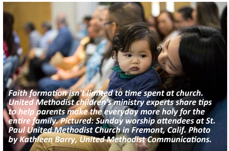
Faith formation isn't limited to time spent at church. United Methodist children's ministry experts share tips to help parents make the everyday more holy for the entire family. Pictured: Sunday worship attendees at St. Paul United Methodist Church in Fremont, Calif.

that your child most enjoys. As they grow, try new ones to meet their changing needs.