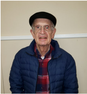
Ken Smith Permanent Endowment Chair