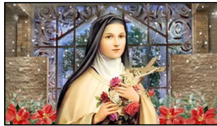
St. Therese, The Little Flower Patron Saint of Court #1768 Feast Day: October 1 st