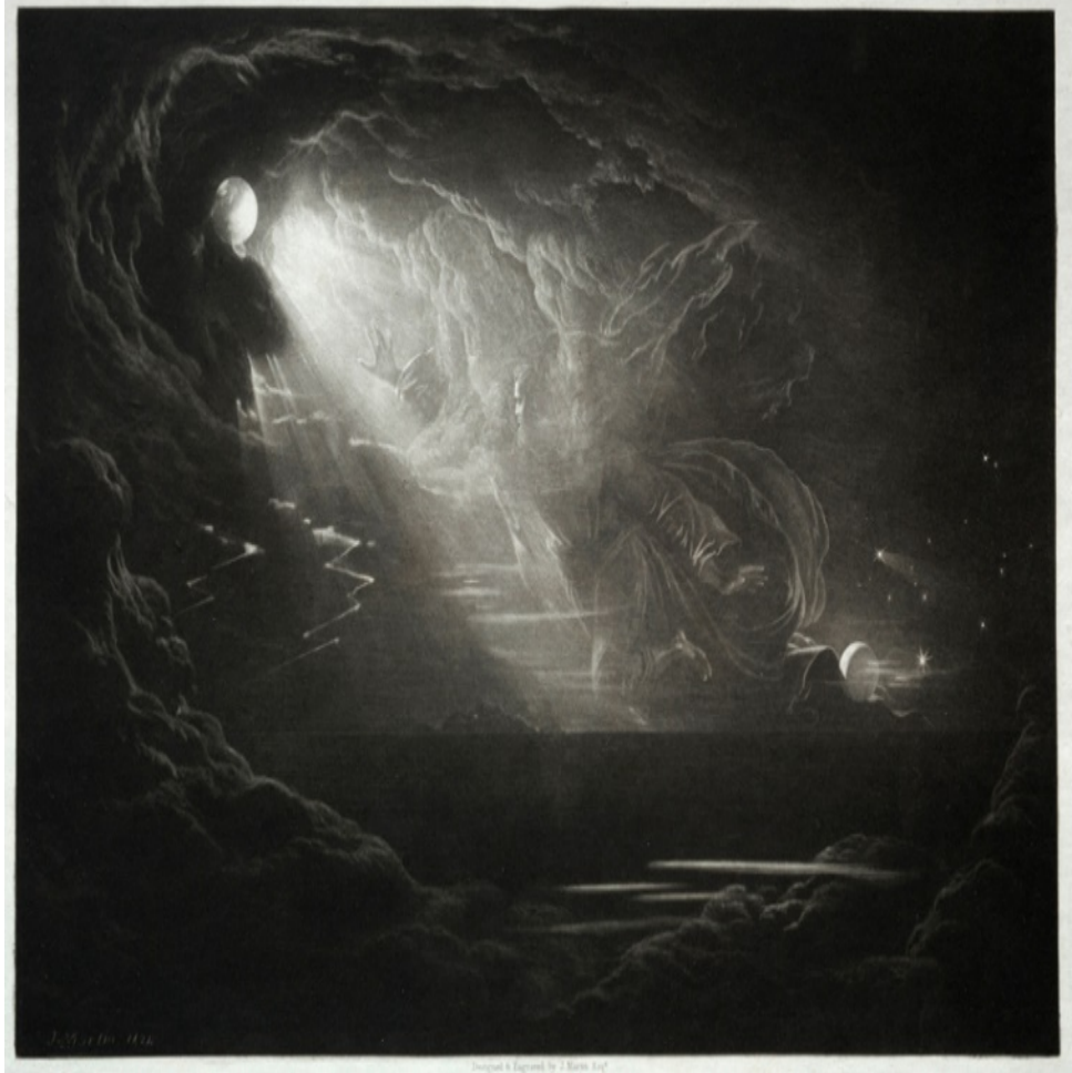
Creation of Light by John Martin, 1824 Cleveland Museum of Art

Office Hours: Monday through Friday – 9:30 AM to 2:30 PM