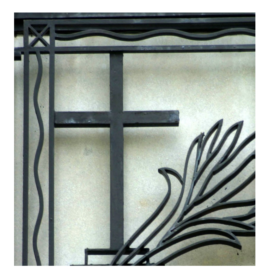
"Cross with Wheat Chaff" Benton Chapel, Vanderbilt University Nashville, TN

The Board of the Southwestern Pennsylvania Synod, Evangelical Lutheran Church Association has awarded a grant of $10,000 to the FOOD 4 KIDS MINISTRY. Food 4 Kids will be receiving quarterly disbursements from the Ethel L. Verney Fund. We are grateful to our friends at First Evangelical Lutheran in Apollo for applying for and securing this magnificent grant.