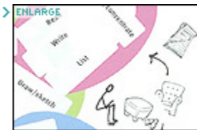
ENLARGE Tools for dreaming. Steelcase, 1999

Tools for bisociation and for the expression of ideas: Three-dimensional “Velcro-modeling” quickly elicits new product ideas from strategy game players.