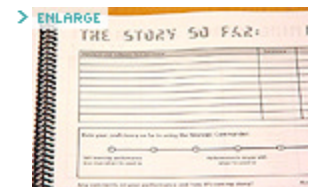
Tools for immersion. Microsoft, 2000

In the final bisociation and expression step, we invite users to express the ideas they have and talk about in the remembering, feeling and dreaming exercises. This is the most exciting part. We have seen people express many completely new ideas for products within a few minutes. The toolkits that we use for this final step are deliberately abstract and ambiguous as you can see below.