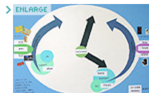
ENLARGE Tools for bisociation and for the expression of ideas. Thompson Multimedia, 2001

Tools for bisociation and for the expression of ideas: Two-dimensional “Interaction Modeling” elicits new ideas in communication.