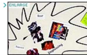
ENLARGE Tools for feeling. Medical Surgical Market Research Group Conference, Cincinnati, Ohio, 1999

Tools for feeling: “Image Collaging” is especially effective for evoking people’s emotional responses from people.