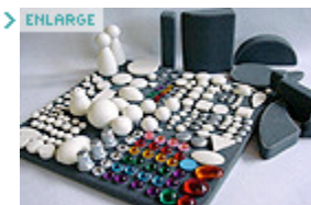
ENLARGE Tools for bisociation and for the expression of ideas. Microsoft, 2000.

Tools for bisociation and for the expression of ideas: Two-dimensional “Interaction Modeling” elicits new ideas in communication.