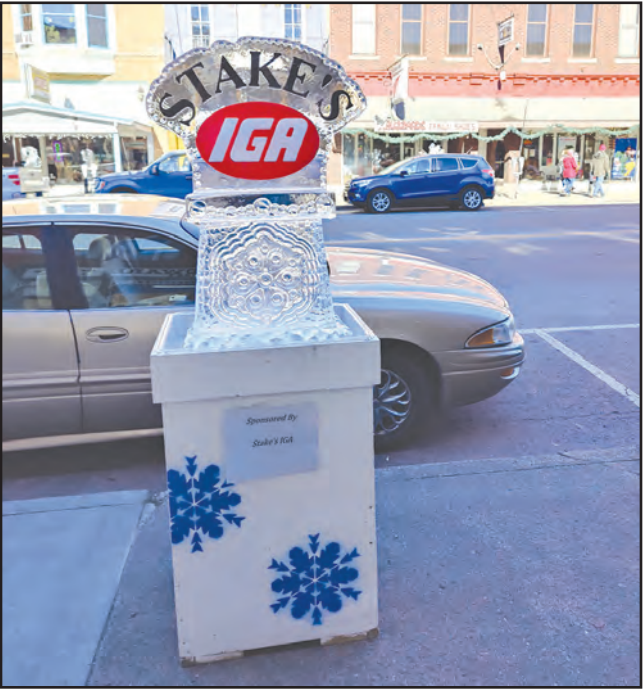
An ice sculpture from a previous Winterfest lines Main Street in downtown Loudonville. This year's frozen pieces of art, sponsored by area businesses, organizations and individuals, will be on display starting Saturday January 11.

Additional events include a snowmobile show featuring vintage and newer models Saturday in Central Park, as well as special events, promotions, and activities at area businesses. The Ohio Theatre will have showings of “Wicked for Good” Friday, Saturday, and Sunday. Saturday evening activities include the Snowball Dance with Rockin’ Al at the American Legion, along with food and drink specials at local restaurants.