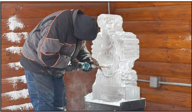
A sculptor from Elegant Ice Creations demonstrates ice carving at the 2025 Winterfest. Demonstrations will be held Saturday from 11 a.m. to 4 p.m. on the hour in Central Park.