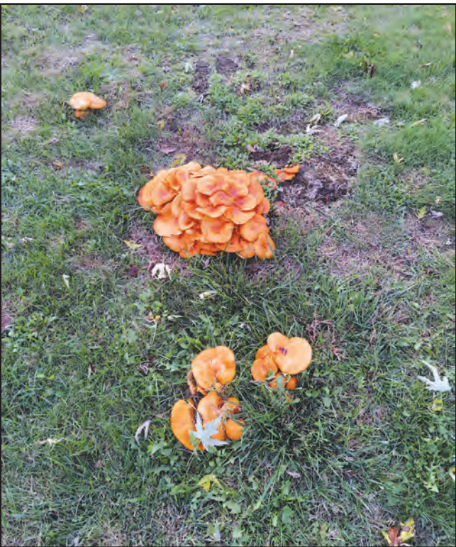
Clusters of vibrant orange jack-o'-lantern mushrooms emerge from a local lawn. Though striking, these mushrooms are toxic and should not be eaten.

Stems are slender, pale orange, fibrous, and generally range from 2 to 6 inches in height. When cut open, the