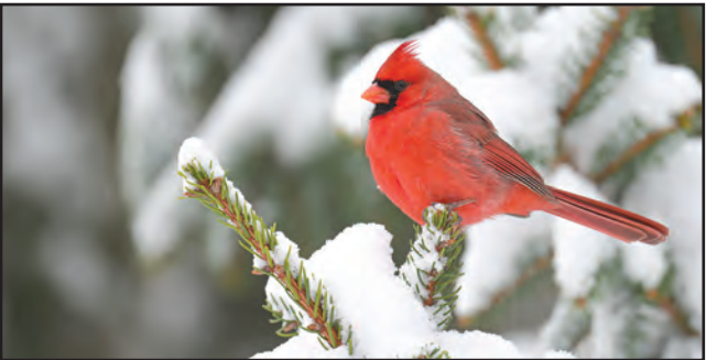
A cardinal perches in an evergreen tree. Cardinals are one of many bird species that benefit from repurposed Christmas trees used to create wildlife-friendly habitats.

By Amanda Chambers The Ohio Department of Natural Resources is encouraging Central Ohio residents to recycle their live-cut Christmas trees for wildlife habitat. By repurposing trees, families can contribute to the local ecosystem and provide shelter for birds, small mammals, and even fish. One of the most effective ways to repurpose a tree is by creating a wildlife-friendly brush pile. The Ohio Department of Natural Resources recommends placing the tree in a desirable location and arranging limbs around it in a square shape. Additional brush can be added on top to form a shelter for various animals. Songbirds such as cardinals, chickadees, and wrens will use these brush piles for food, nesting, and protection from predators. Small mammals like rabbits and chipmunks also seek refuge in the piles, which are vital for sheltering young ones. Additionally, brush piles provide a safe haven for overwintering insects, including bees and butterflies. However, before discarding or repurposing a tree, it is essential to remove any decorations such as tinsel, lights, TREE Cont. to pg. 8