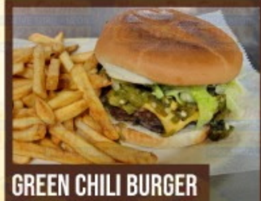
GREEN CHILI BURGER