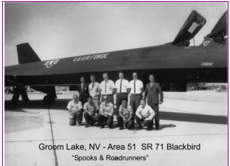
Bottom row, 2 nd from the left---1965