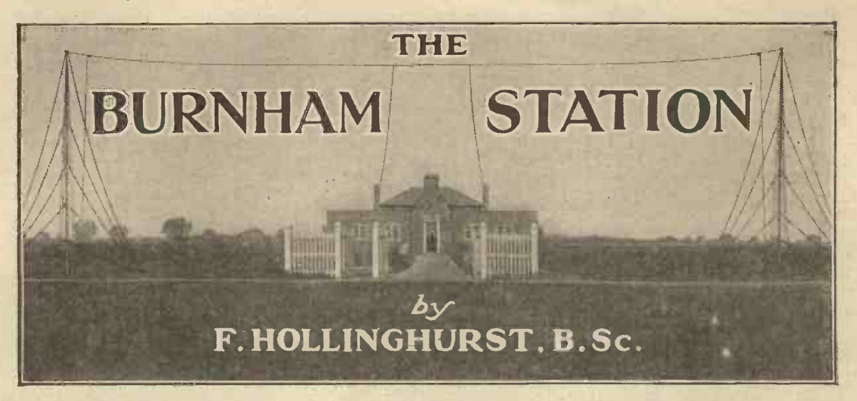
Some interesting details of the new station to augment the long distance CW traffic from and to ships, formerly handled by Devizes