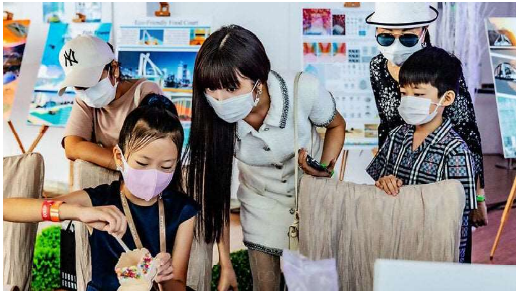
M-EXPO welcomed students, parents and award judges to Sky 100, featuring extra-curriculum activities such as workshops for 3D printing and modelling of mini greenhouse designs