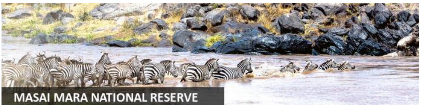
MASAI MARA NATIONAL RESERVE