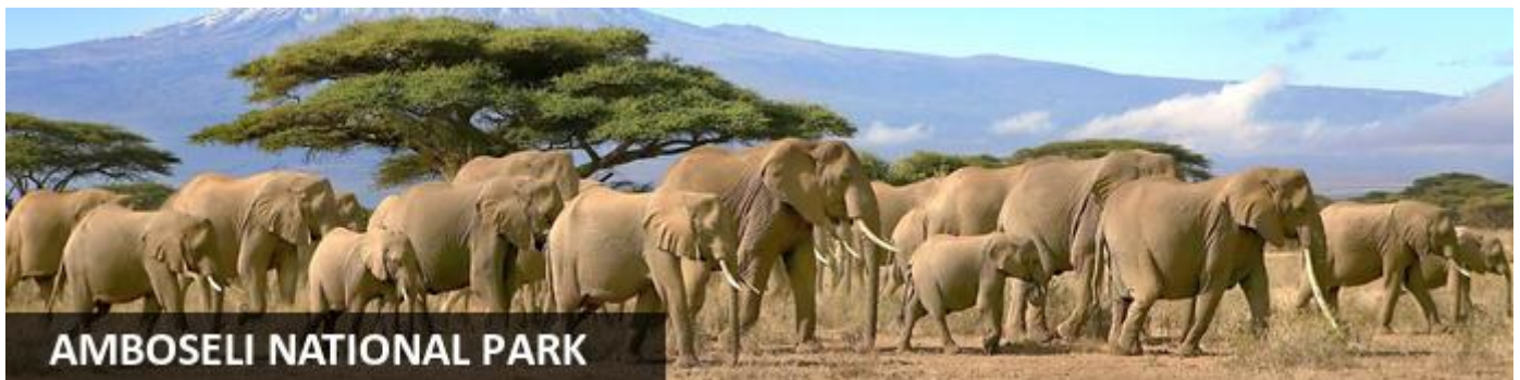
AMBOSELI NATIONAL PARK