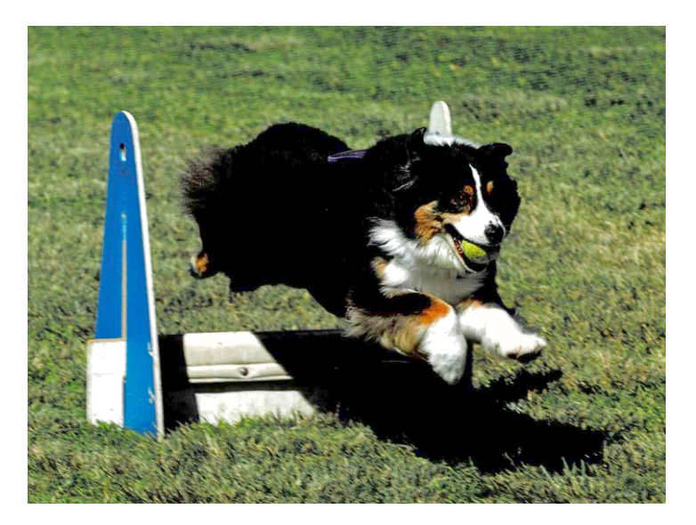
Photo is of the beautiful Shelby taken at Dogs Day Out in September 2023.

So spare a thought of how Flyball started 20 years ago at Para and it has come along way from its humble beginnings all those years ago.