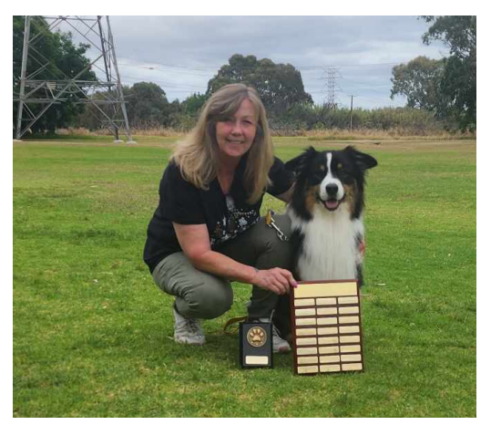
Donna and Dash Top Obedience Dog