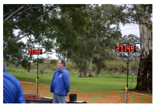
Congratulations to Para Swaggers and Para Doggy Dashers for the first dead heat in SA flyball racing – 27.149 seconds exactly!

Congratulations Rebecca and Rumble on your first flyball title!