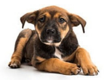
Have fun and be creative!