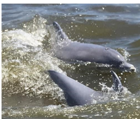
Watching the dolphins - Shaelyn