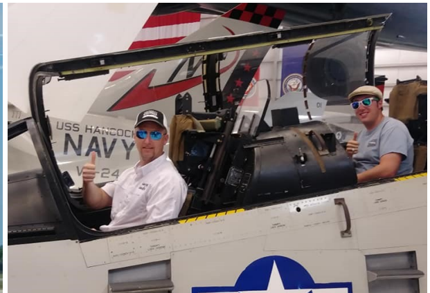
National Naval Aviation Museum, Pensacola, Florida