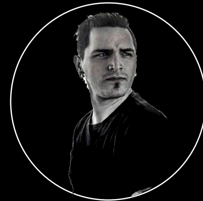
Eros Cartechini Music Composer