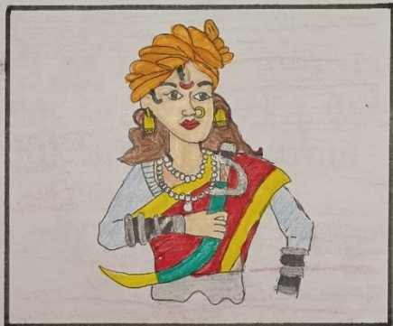
Rani Lakshmi Bai