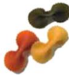
RAINBOW BOW TIES