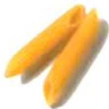
HEAVY WALL PENNE