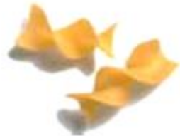
EXTRA WIDE EGG NOODLE