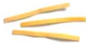
EGG NOODLE 1/8"