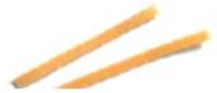
KLUSKI EGG NOODLE 1/8"