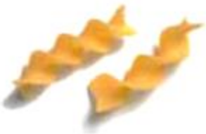
WIDE EGG NOODLE