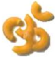
HEAVY WALL MACARONI