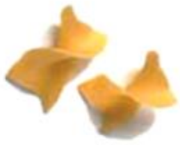
SUPER WIDE EGG NOODLE