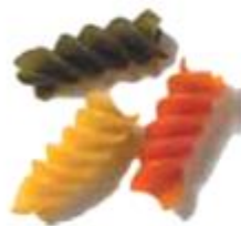
TRI-COLOR ROTINE (2)