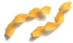
MEDIUM EGG NOODLE