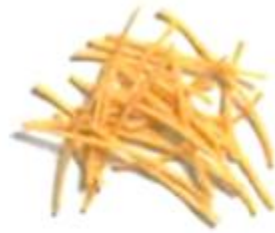
FINE EGG NOODLE