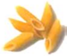
HALF MINI PENNE