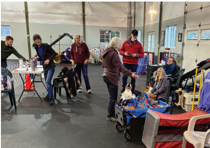
Next dog! The busy Utility ring.