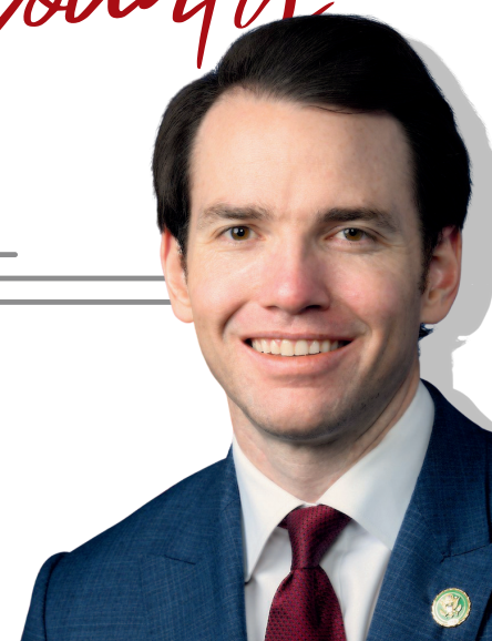
U.S. Congressman Kevin Kiley