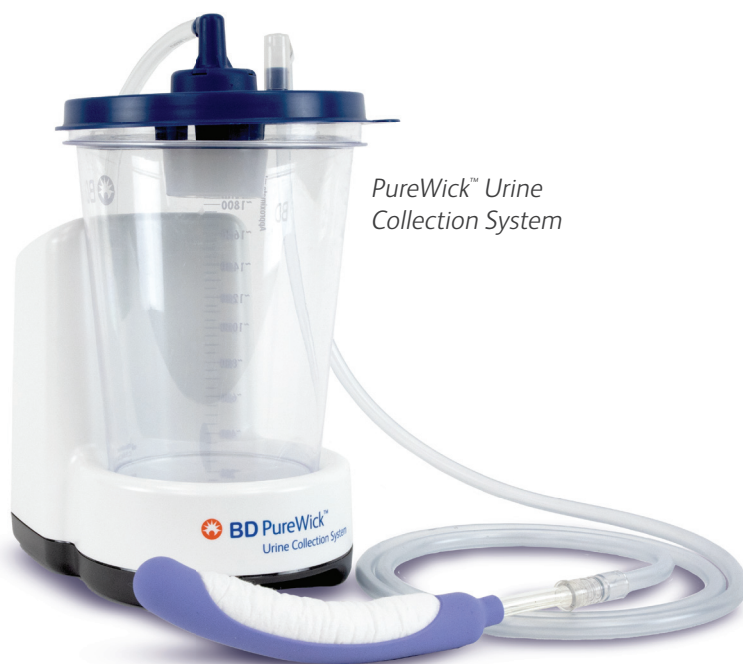
PureWick™ Urine Collection System