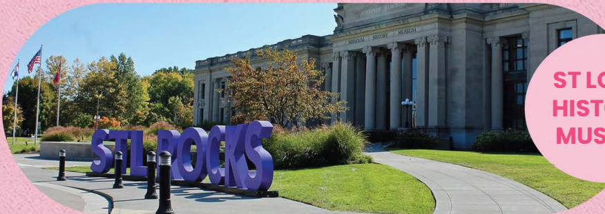
ST LOUIS HISTORY MUSEUM

Bellefontaine Rec Center, 9669 Bellefontaine Rd, St. Louis, MO 63137