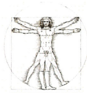
Divine Proportion φ/ Vitruvian Man

33 = Coronation of the One/Sovereign/Self-evident/True Man/φ = 1, 1, 2, 3, 5, 8, 13