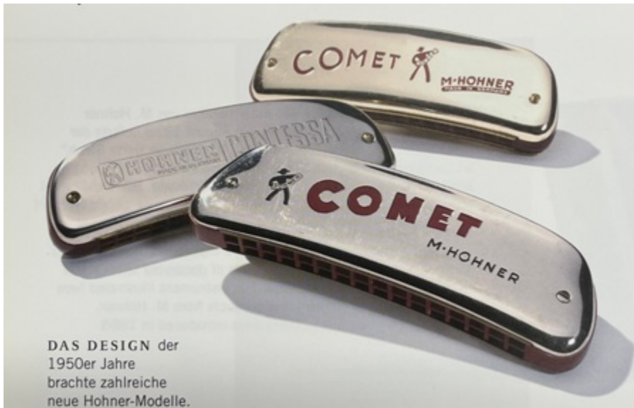
DAS DESIGN der 1950er Jahre brachte zahlreiche neue Hohner-Modelle.