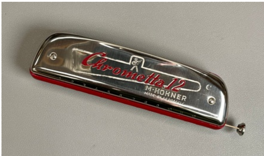
1956 HOHNER Chrometta 12 (my collection)