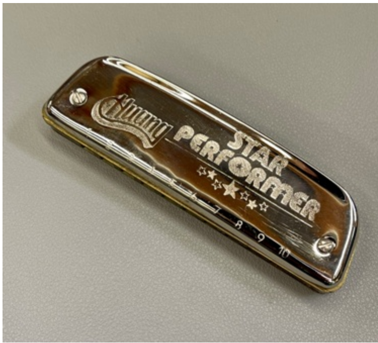
Imitation can be the sincerest form of flattery (circa 1998 my collection)