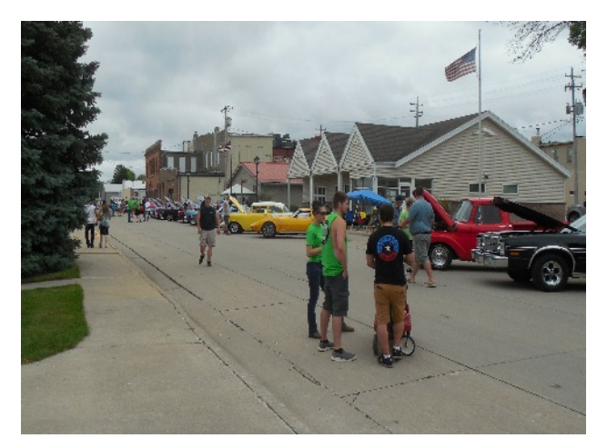
Victor Car Show