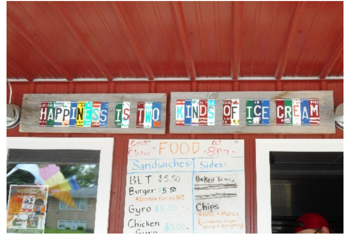
Sadie Jane's Ice Cream in New Sharon