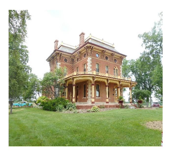
Victorian Home near Pella