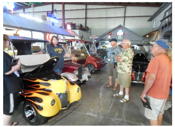
Street Rods in Montezuma