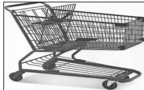
The most expensive vehicle to operate in 2023

Santa's whiskers Need no trimmin' He kisses kids Not the wimmin' Burma-Shave