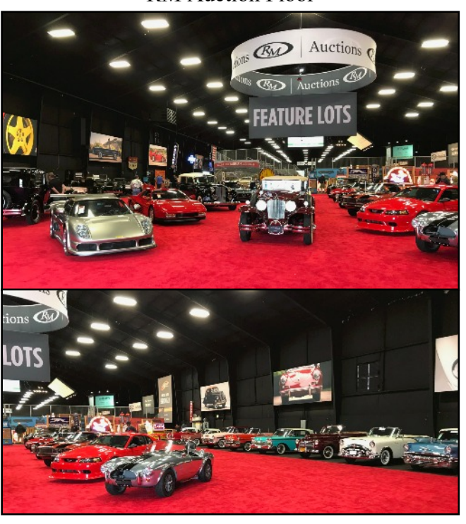
AACA 2019 ZENITH AWARD WINNER 1931 BUICK A-39 SPORT ROADSTER