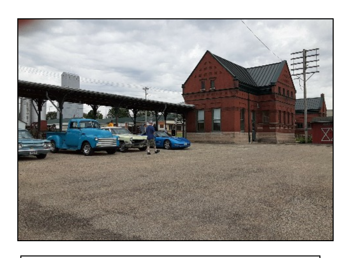
Illinois Central Railroad Depot