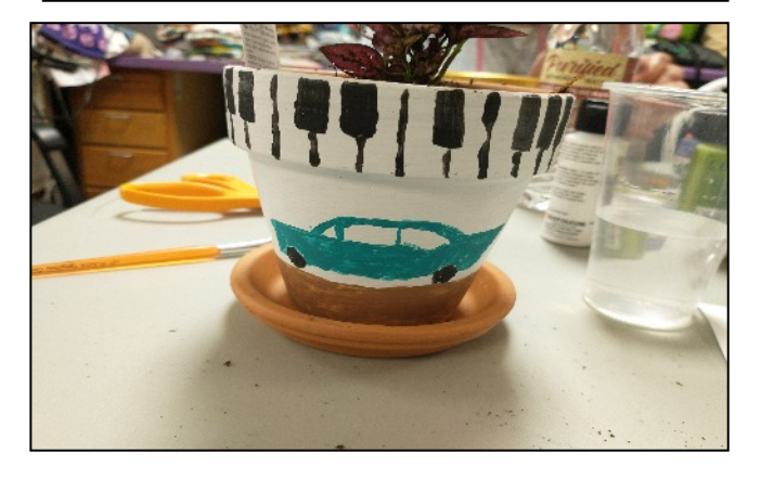
Make it & Take it-guess who's