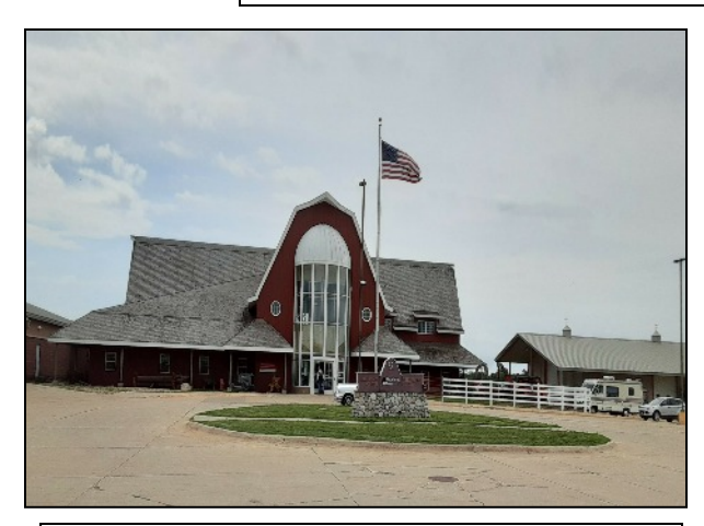
Heartland Acres Ag Museum