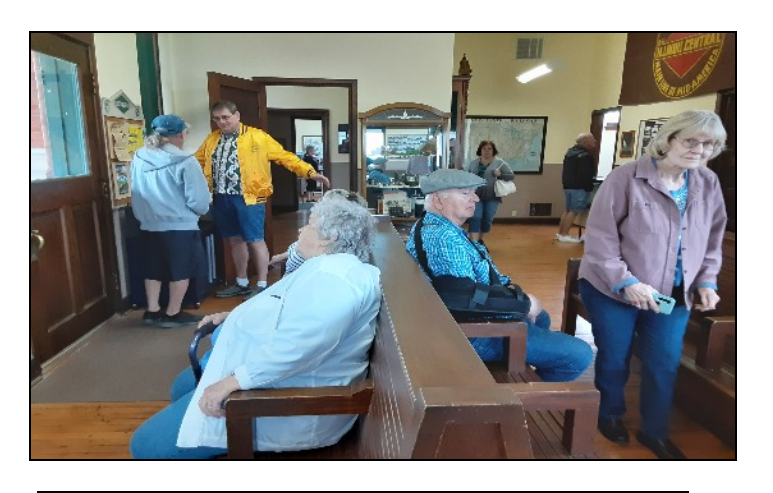
Inside Railroad Depot Museum