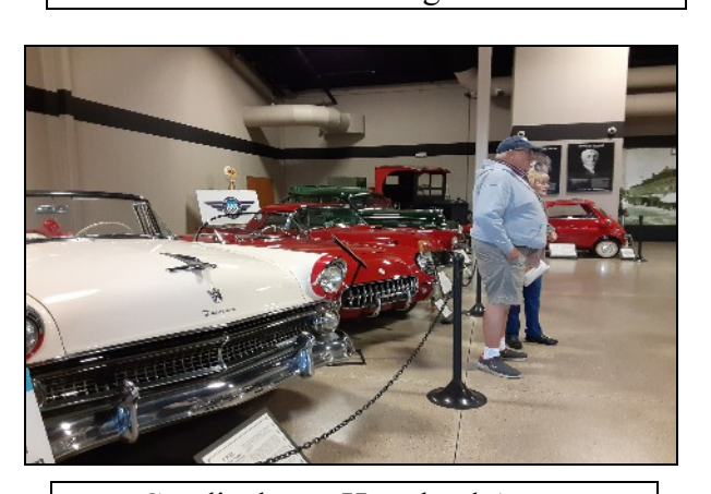
Car display at Heartland Acres