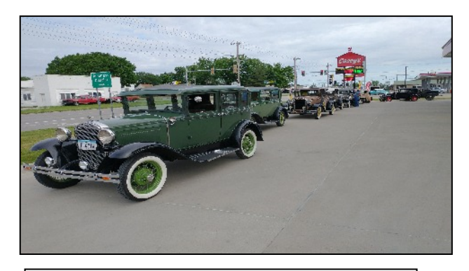
Cars on tour