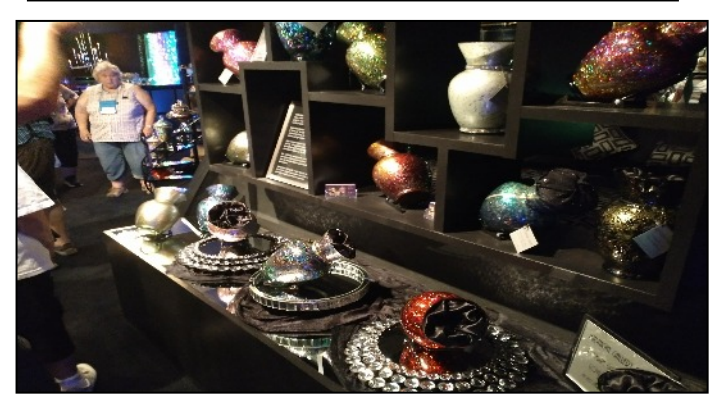
Midnight Gallery Glass Urns & Purses