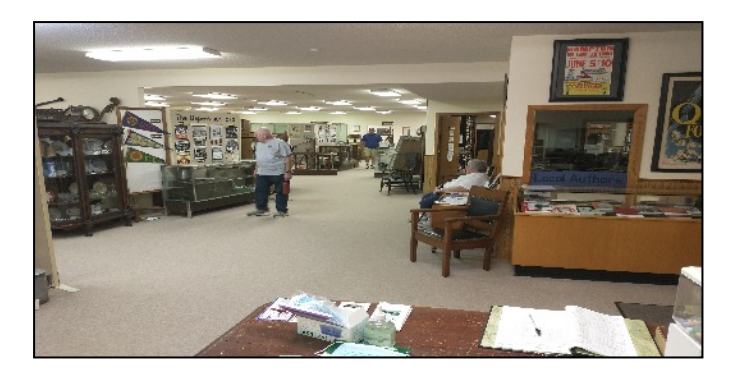
Hampton Fairgrounds Museum