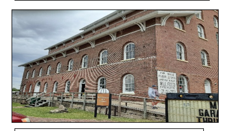
Wapsipinicon Grist Mill Museum