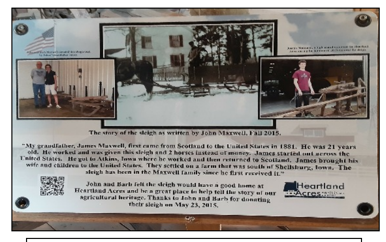
Maxwell's Donation to Ag Museum