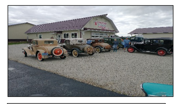
Ice cream stop-Spartan Freeze