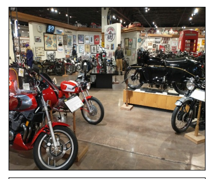
Anamosa Motorcycle Museum