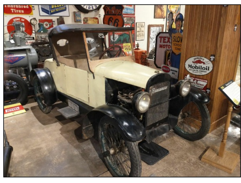
Anamosa Motorcycle Museum