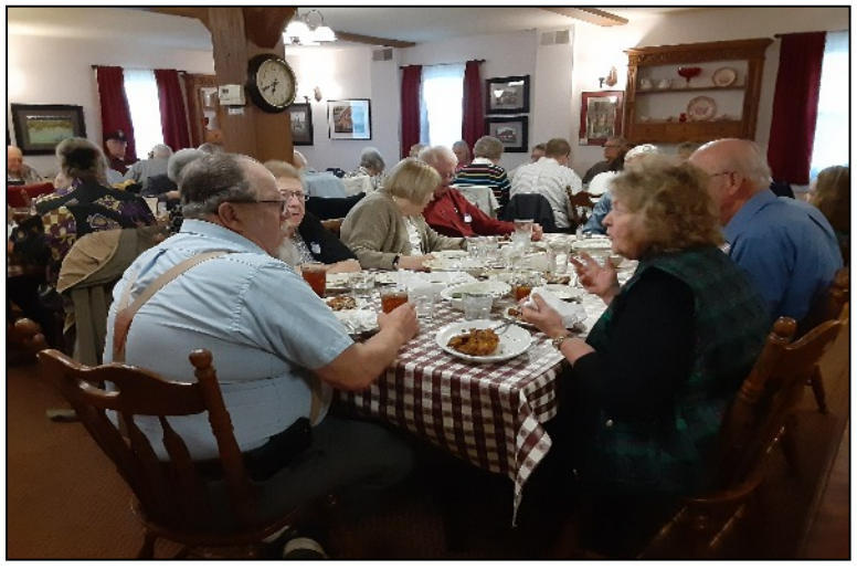
Amana Spring Banquet