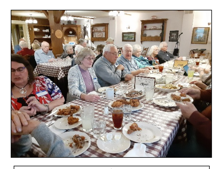
Amana Spring Banquet