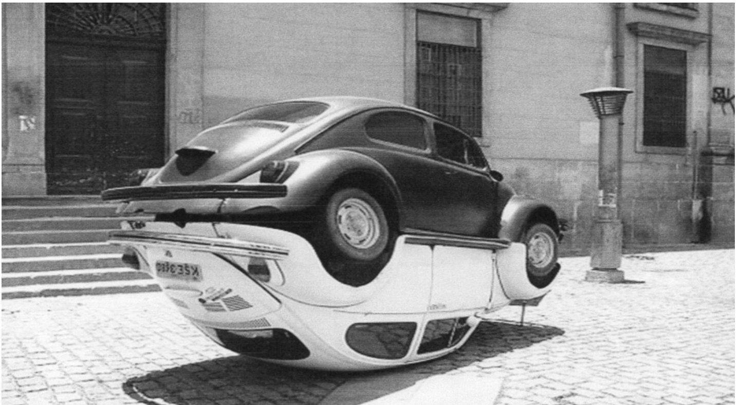
Black and white upside down funny car

Fennimore Railroad Mus. Rural Route 1 Popcorn Ringling Bros. Circus Museum International Clown Museum Black color fleet of fire Engines Mineral Point Pendarvis Homes Mineral Point Snake Rag Rd.