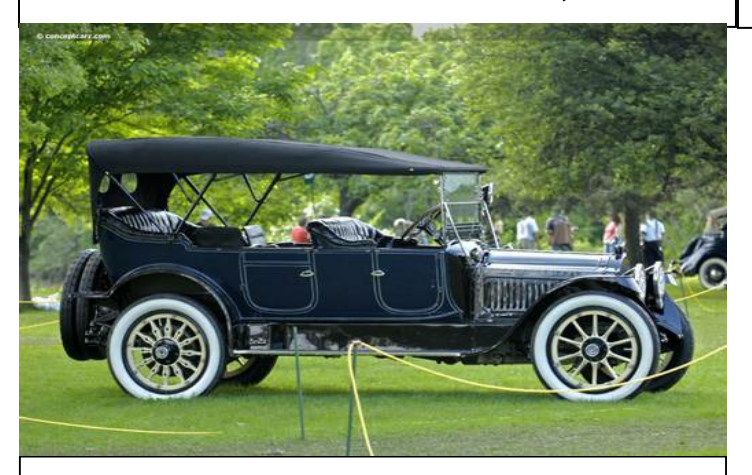
What car was the first production V12, as well as the first production car with aluminum pistons?