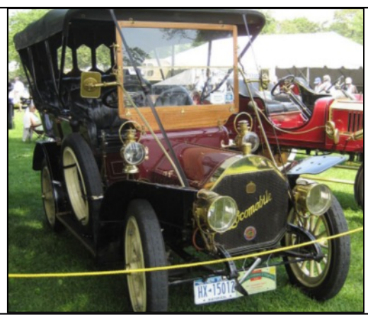
1907 Locomobile Type E Touring