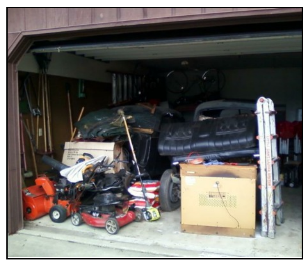
So how long will the cars set before he gives up and sells them on craigslist?

My dad's rules came to mind again as I visited a friend this past summer. When he raised the garage door there set two unrestored cars. He informed me that they were his dads and were passed down to him after his death. He continued that the cars had been in his garage for eight years. The car were being used as a shelf. (See Below)