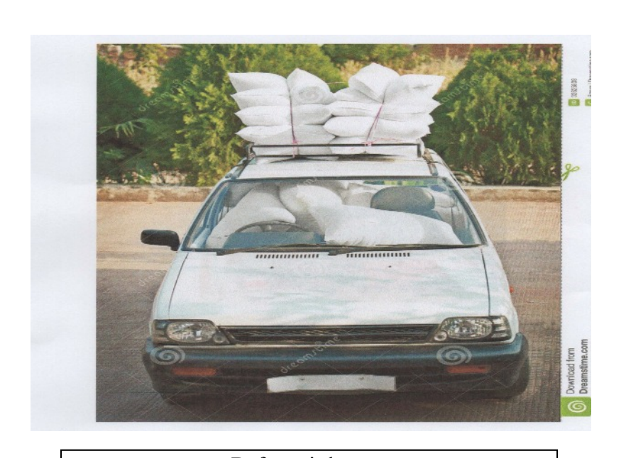
Before air bags