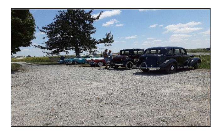
Bass Farms Car Show July 29, 2023