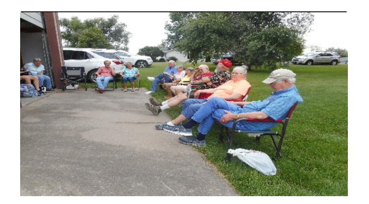
National meet in Moline, Ill August 13th