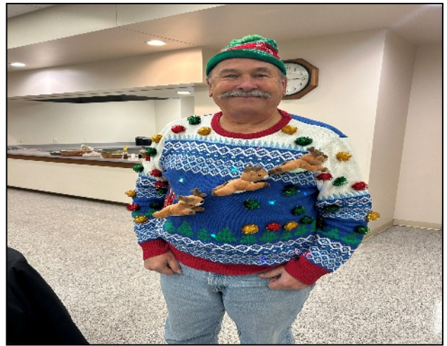
Xmas party Dec. 8, 2025