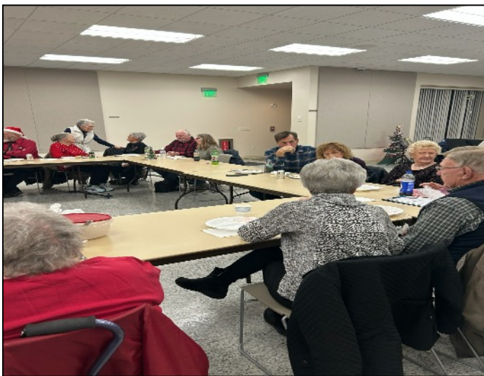
More Xmas party photos Dec. 8, 2025