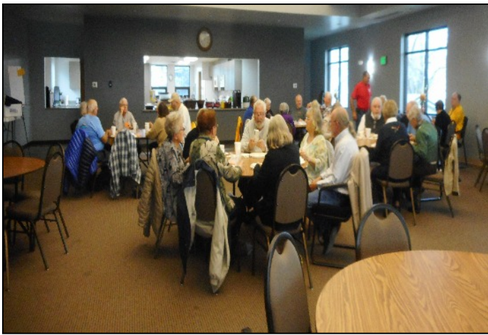
Fall banquet Nov. 1, 2025