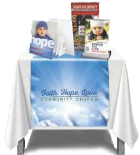
Table throws and runners are a great way to have booths stand out at fairs and meetings. Tabletop and counter cards, meanwhile, are an effective way to show pricing, schedules, and additional information about your cause.