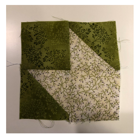
For the center unit: From the light fabric: Cut one 4 1/2 inch square