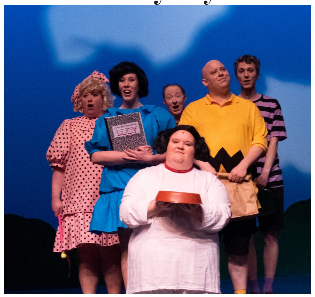
Community Theatre for Ketchikan, Alaska December 16, 2021