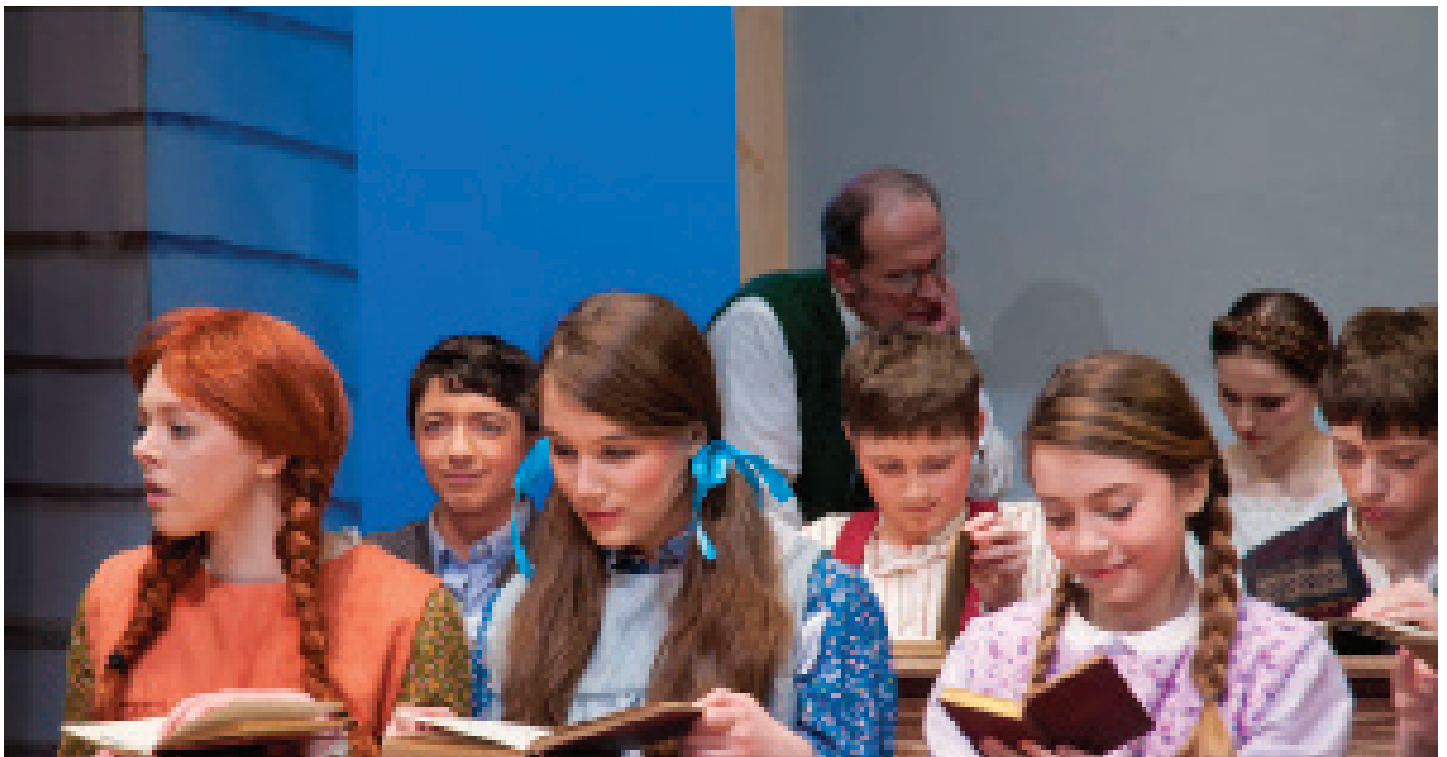
The cast of Anne of Green Gables