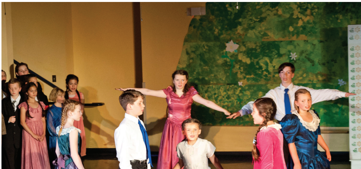
The cast of The Sound of Music ArtsCool 2014

Director/Teacher Ashley Byler worked with a small group of 5 – 7 years olds and produced the story Jumping Beans which was performed Saturday afternoon before The Sound of Music .