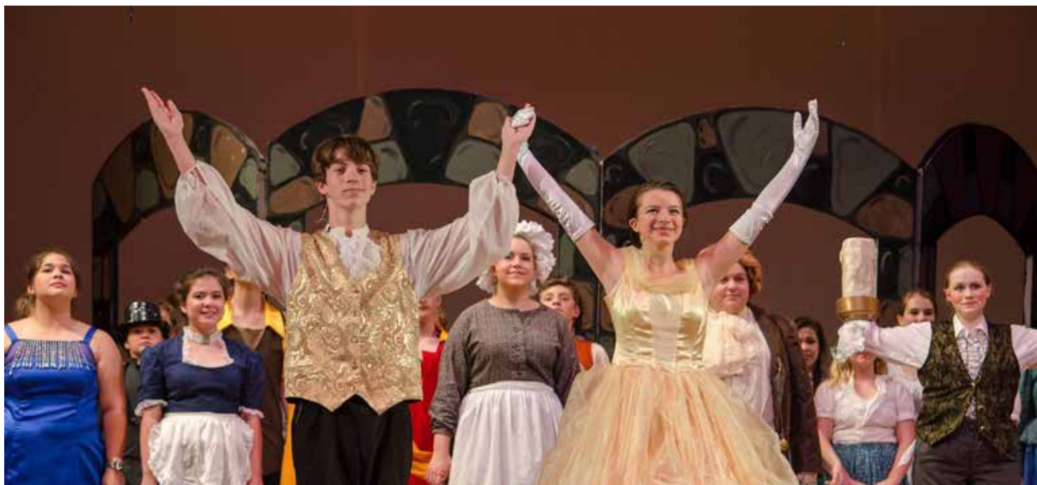
The cast of Disney's Beauty and the Beast, Jr. ArtsCool 2015