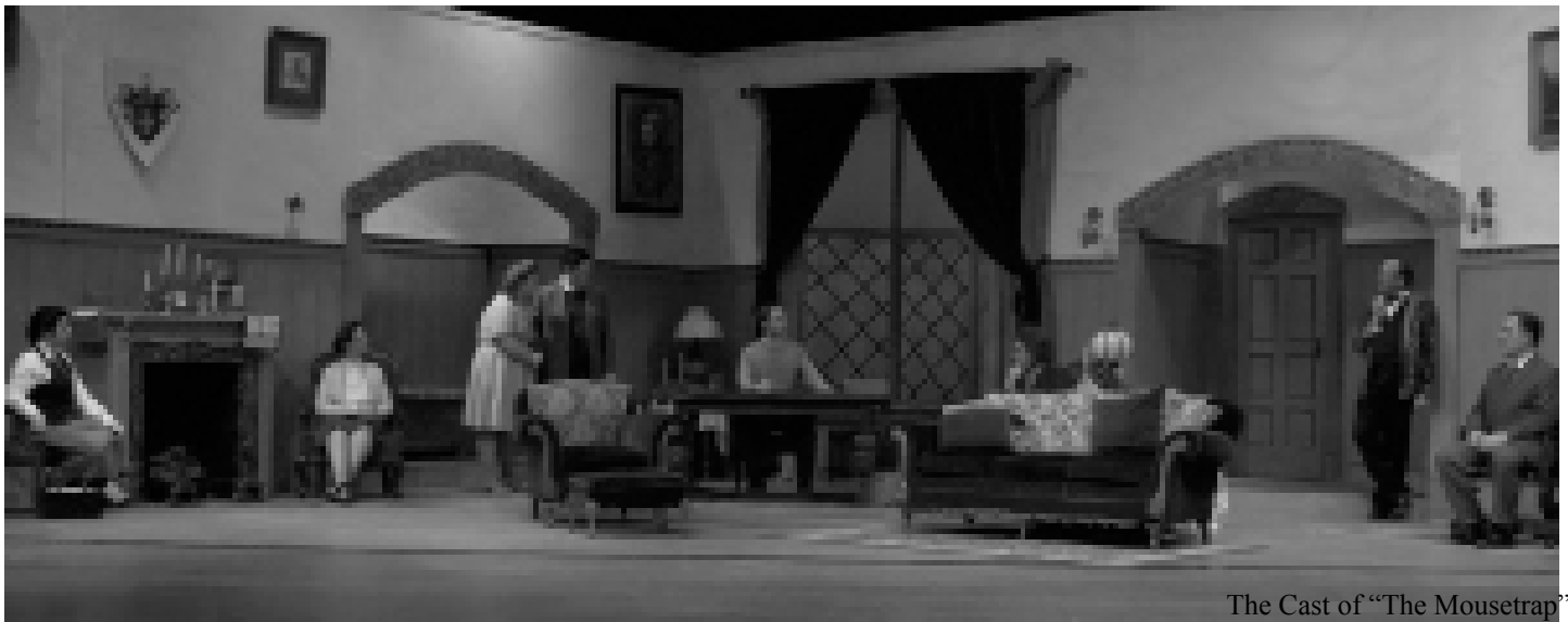
The Cast of "The Mousetrap"