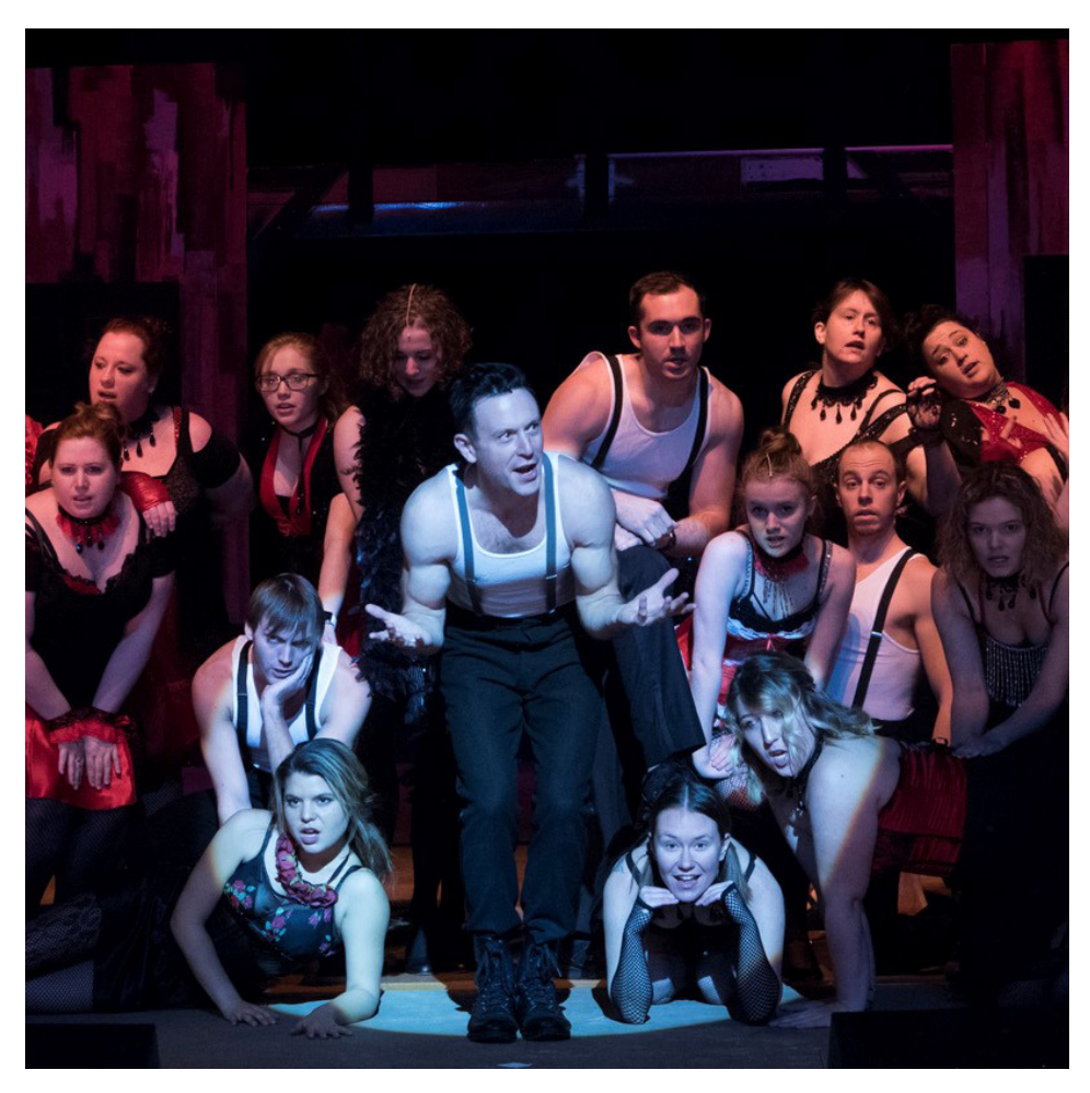
Community Theatre for Ketchikan, Alaska December 13, 2018