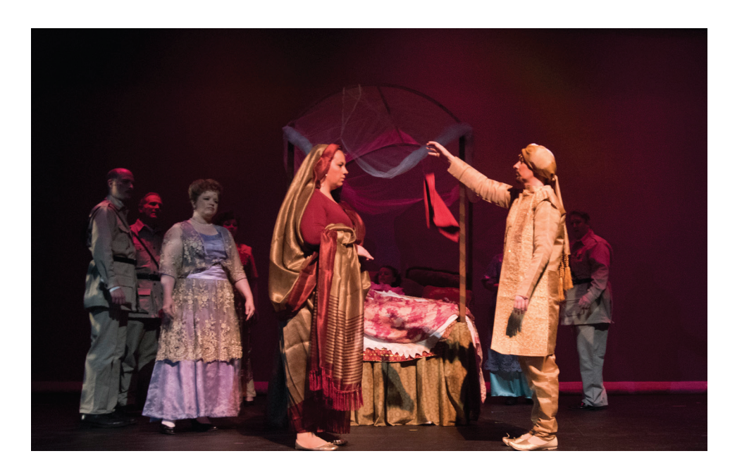
FCP Board Treasurer