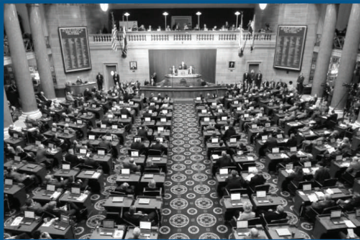
Animals prevailed in Jefferson City!

After another challenging year in the Missouri Legislature, we are elated to report that the animals have once again emerged victorious. This is particularly heartening as the puppy mill industry and other animal users waged a fierce battle to overturn our laws protecting animals – solely to profit from animal neglect and exploitation.