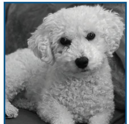
Wiggles, Puppy Mill Campaign Manager Bark to Ban Puppy Mills

information and how to join in the legislative fight to protect the welfare of dogs. In addition, the campaign arranged for numerous television stories on puppy mills, including frequent TV appearances of Wiggles, our official campaign spokesdog and puppy mill survivor.