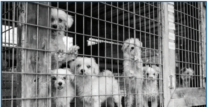
The Alliance is committed to advocating for puppy mill dogs with Congress and all of our federal officials with the help of our federal lobbyist.

Most noteworthy of these proposed rules would prohibit substandard breeders whose licenses have been revoked due to serious Animal Welfare Act violations from continuing to do business as usual by relicensing under a family member's name.