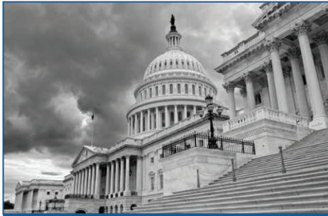
Good News from Washington for puppy mill dogs!

The Alliance's federal lobbyist once again triumphed in having language inserted into the most recent federal budget instructing the USDA to continue performing unannounced