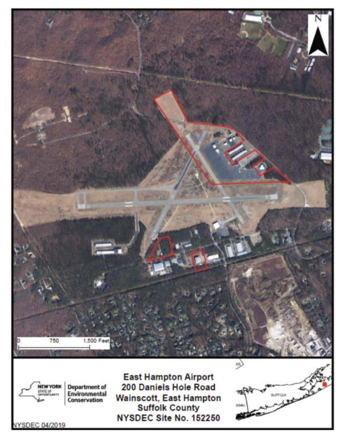
Appendix C - Site Location Map